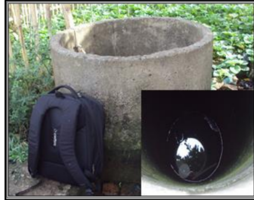
Figure 3 Photograph view of the S02 Water Sampling Well in the Abanuang area, photographed towards N90°E.

e. The S02 well is included in the moderate to high aquifer area