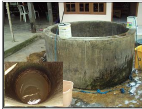
Figure 5 Photograph view of the S05 Water Sampling Well in the Lemmobeng area, photographed towards N120°E.

d. Well S05 is included in the medium to high aquifer area.