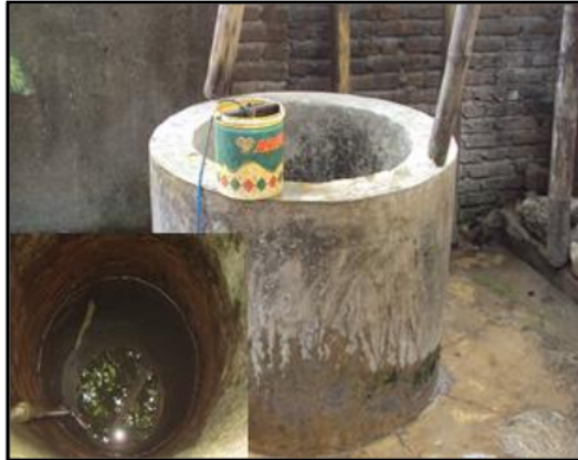
Figure 2 Photograph view of the S01 Water Sampling Well in the Lumpue area, photographed towards N90°E.

c. Well S01 is included in the moderate to high aquifer area.