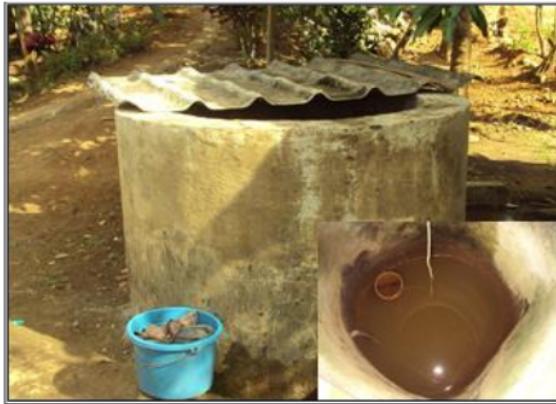
Figure 4 Photograph view of the S04 Water Sampling Well in the Lemmobeng area, photographed towards N120°E.

e. Well S04 is included in the moderate to high aquifer area.