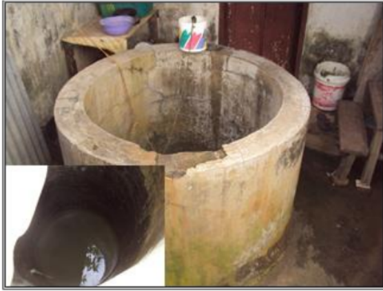
Figure 6 Photograph view of the S06 Water Sampling Well in the Lumpue area, photographed towards N95°E.